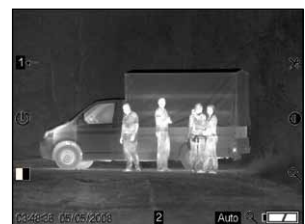
Identification of people