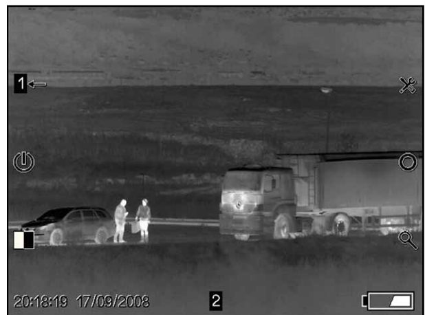
Surveillance and intelligence